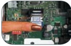
Flash Memory with Smart Stick allows to quick and easy currency updates.